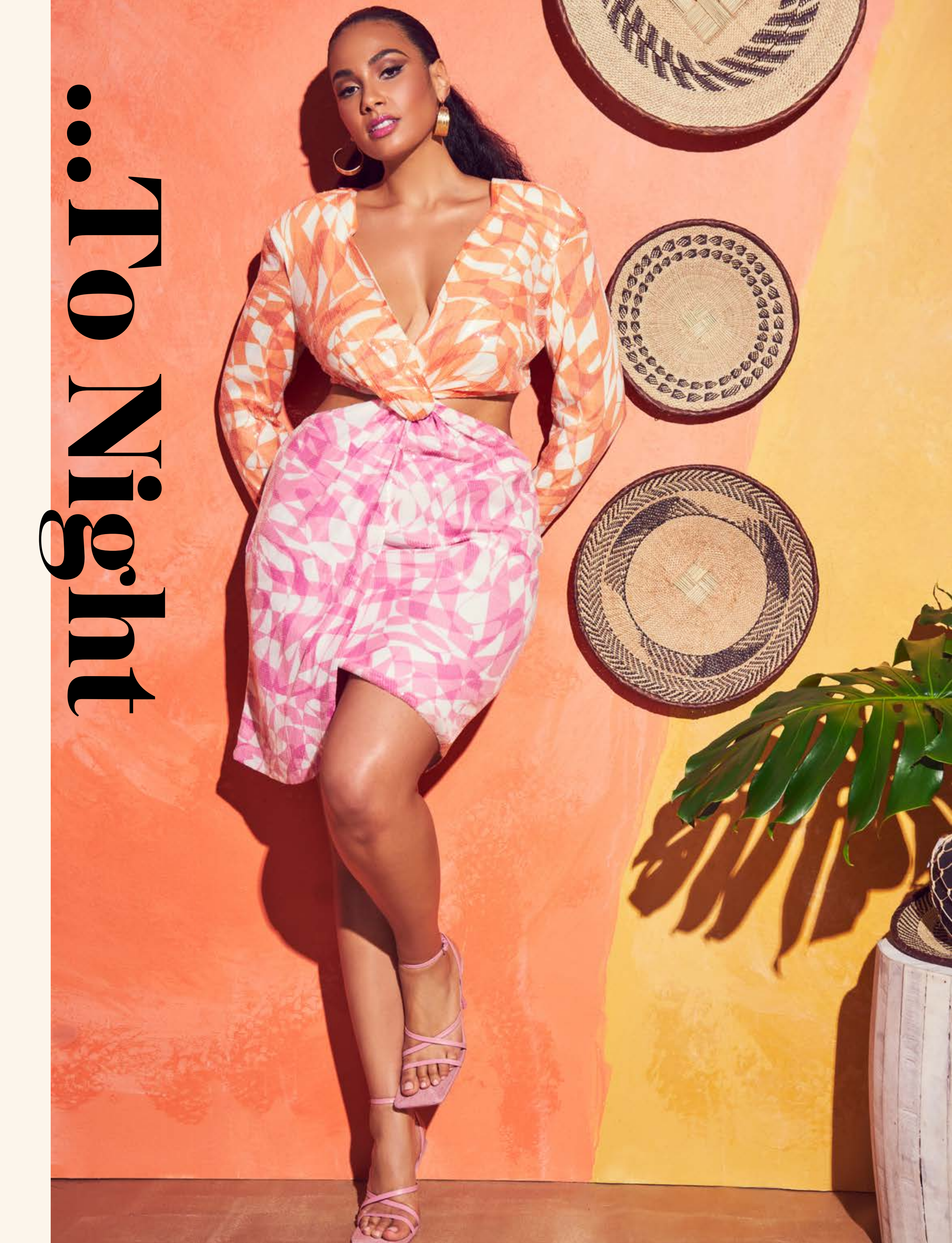
RIGHT Sequin Blocked Mini Dress $129.95