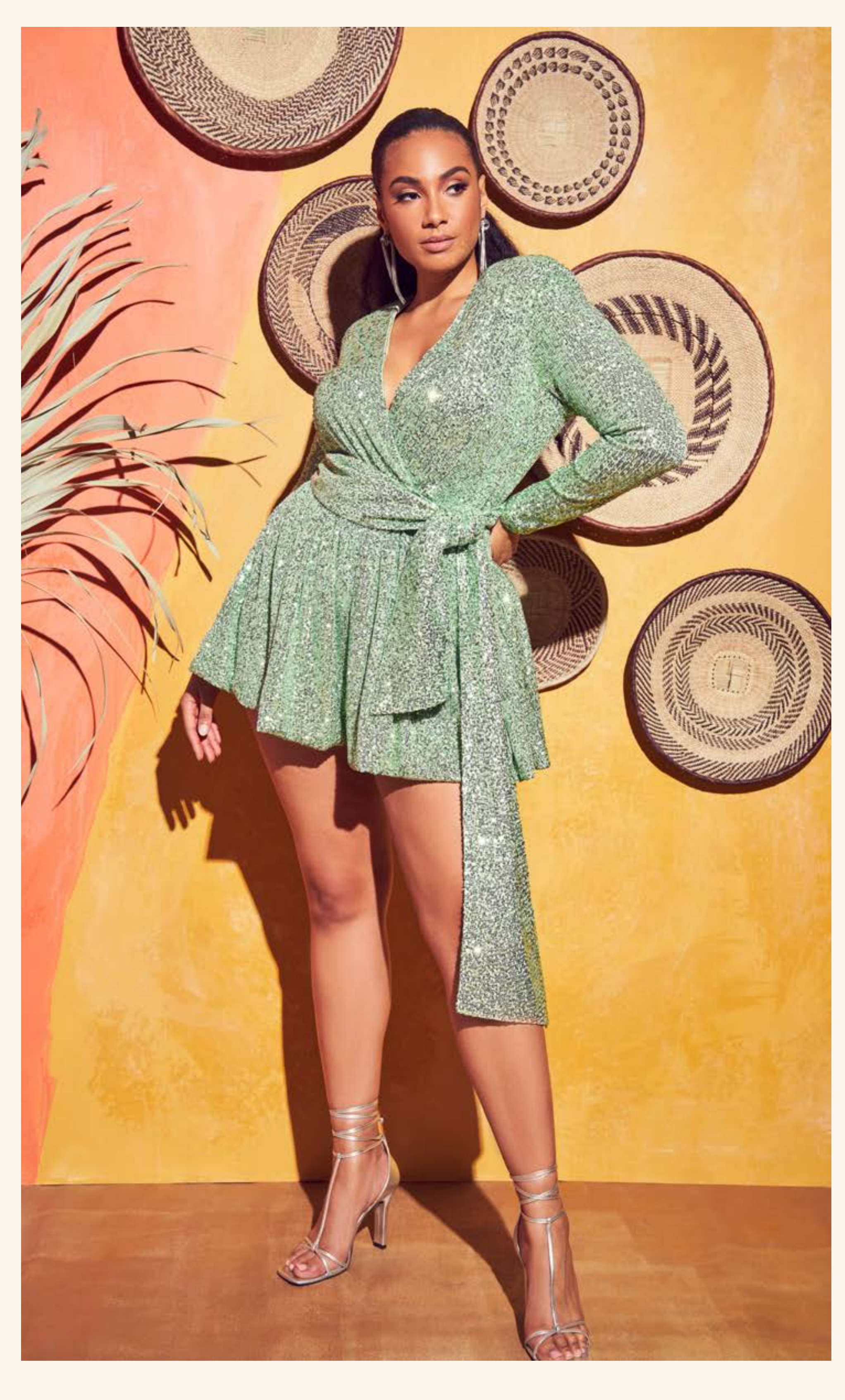
LEFT Sequin Romper With Tie $149.95